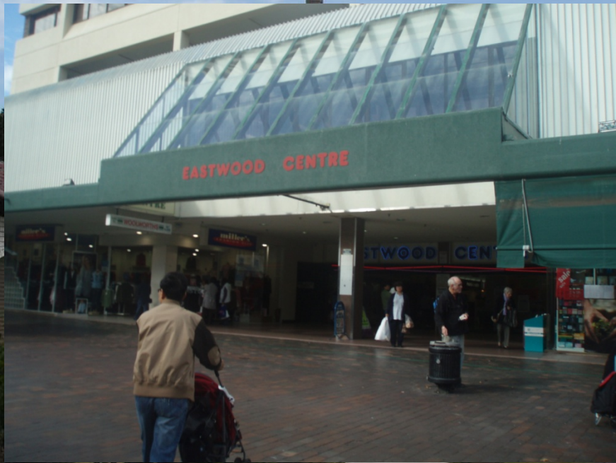
Eastwood Centre (upper)