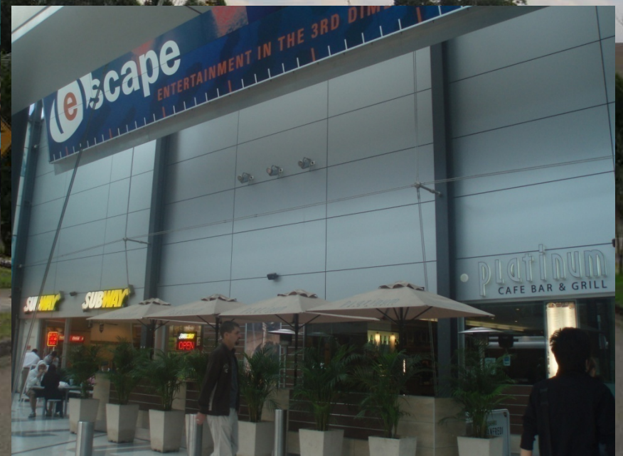
Macquarie Centre (right)